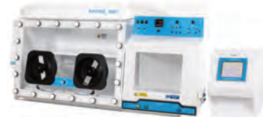
INVIVO 2 500 Facilitates Transfer of Small Equipment