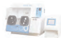
INVIVO 2 300 Compact Workstation - Larger Interlock