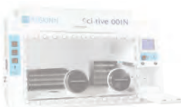
SCI-TIVE Total In Vitro Environment Our Most Advanced Workstation Imaging ready system, also features HEPA filtration